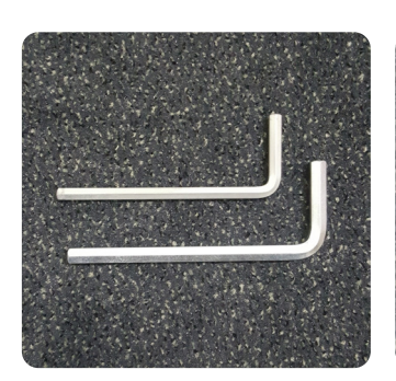
2x Allen key (4 en 5 mm)