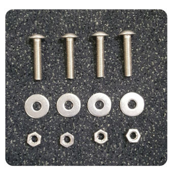
Set for Rotaid Cabinet