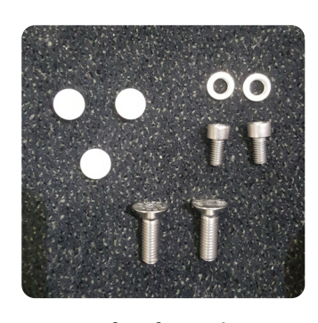
Set for footplate