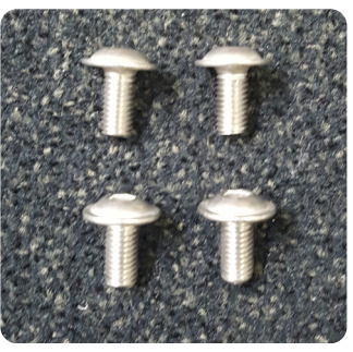
Set for sunroof (optional)